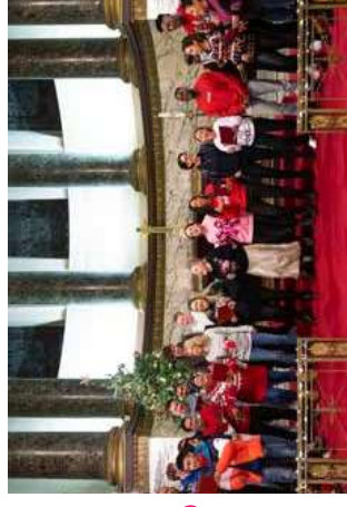
The EastEnders choir performing at our Christmas Carol Concert in December 2022.